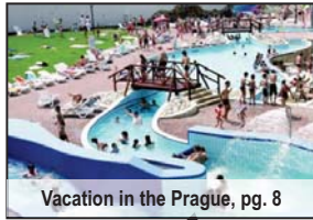
Vacation in the Prague, pg. 8