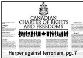
Harper against terrorism, pg. 7