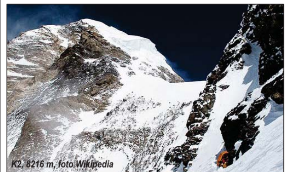
K2, 8216 m