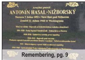
Remembering, pg. 9