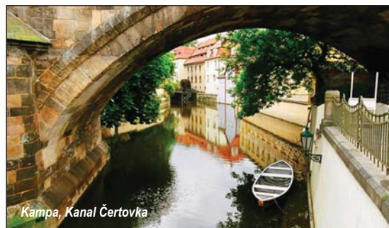
Kampa, Kanal Čertovka

on joining the tour with a group larger than ten people, reservations are required so that we can be sure to have an appropriate number of guides at the tour starting point on the given day.