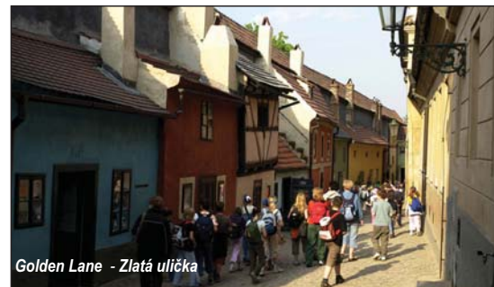
Golden Lane - Zlatá ulička