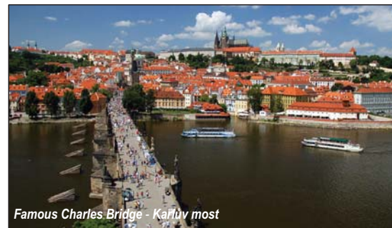
Famous Charles Bridge - Karlův most

This tour covers: Old Town Square, Astronomical Clock, Charles' Bridge, Old Jewish Quarter, Old New Synagogue & the Golem, Powder Tower, Prague Castle & St. Vitus' Cathedral, Art Nouveau Municipal House, Powder Tower, Church of Our Lady Before Tyn, Wenceslas Square, St. Nicolas Church...and much, much