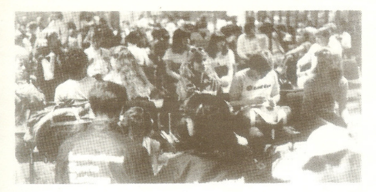
Sometimes traveling means waiting.