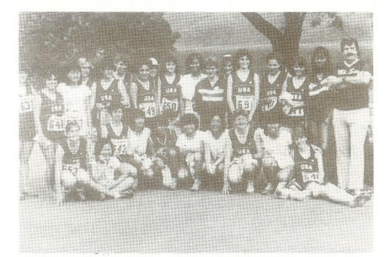
Here we are with our Singapore competitors after the big race.

Would you say the athletes benefited from this trip? Did visiting Singapore and Malaysia and Korea have an effect on the minds and personalities of these teen-agers. You might say that.