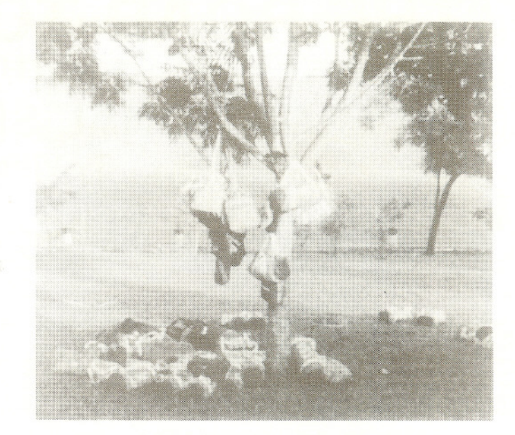
This was out "bag tree" at race time.

With Solomon-like judgement, the Singapore authorities declared two races and awarded medals for both groups. The US runners had been split up into teams of seven and won first, second and third places in the 'team' competition, Singapore runners being somewhat weak. Not so in the male