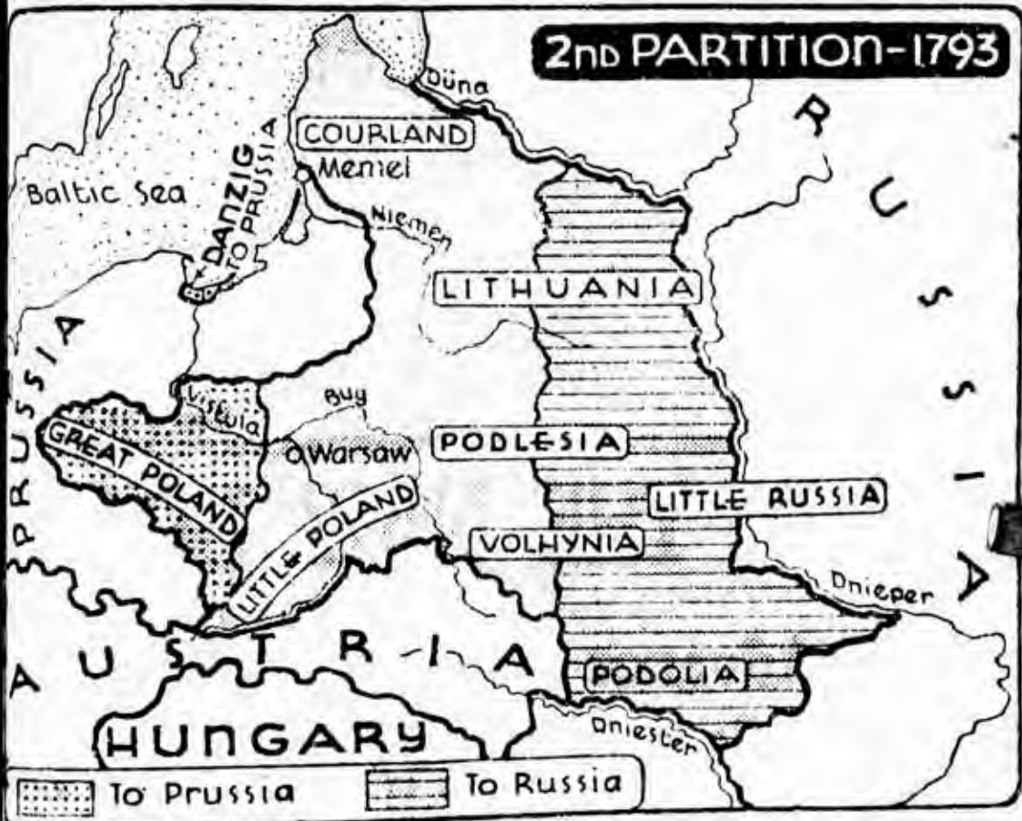
THE SECOND PARTITION, 1793—Poland became a third of her original size when Prussia and Russia stripped her of more land, including the port of Danzig.