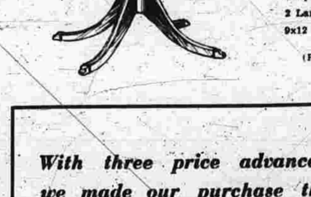
With three price advances since we made our purchase this carpet is even a greater value!