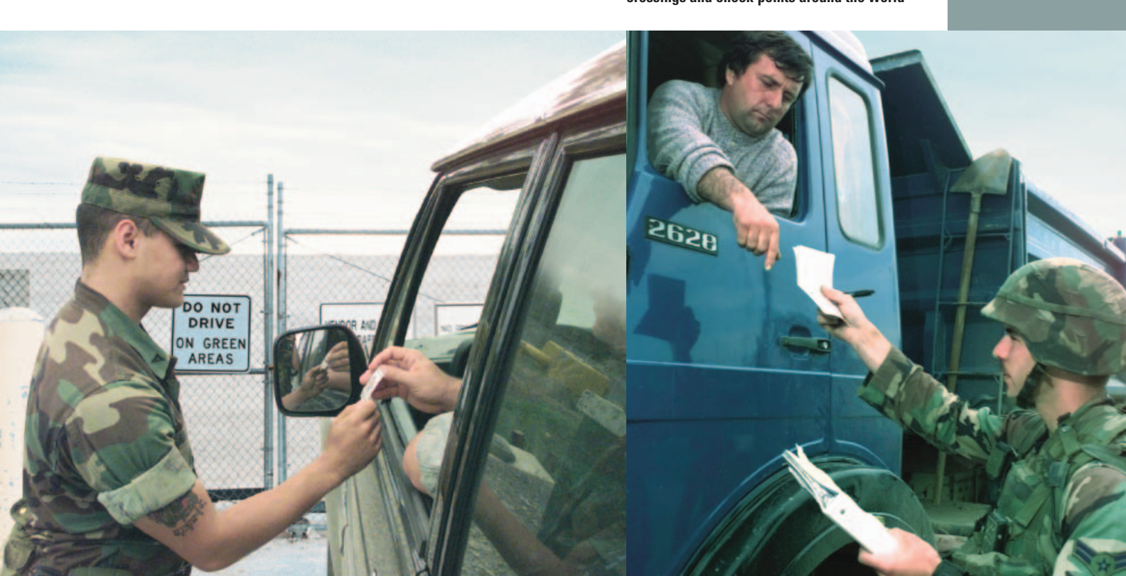
The EGIS Defender can be used at border crossings and check points around the world

The EGIS Defender is designed to be easy to use for all operator skill levels. The system automatically starts, interprets results, and monitors itself for optimum performance.