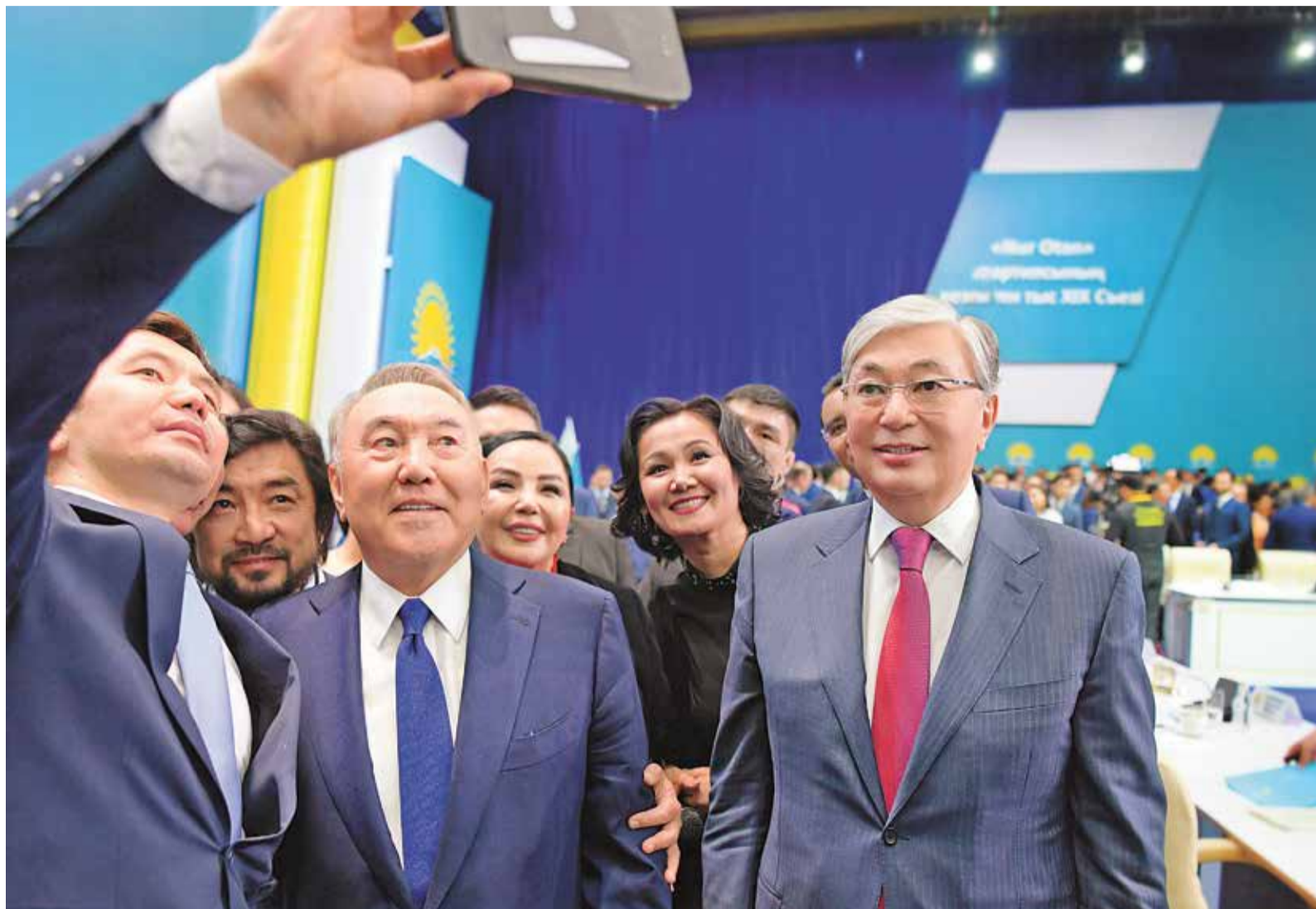
Kazakh First President Nursultan Nazarbayev (C) and current President Kassym-Jomart Tokayev pose for selfie with the participants of the Nur Otan party congress on April 23.