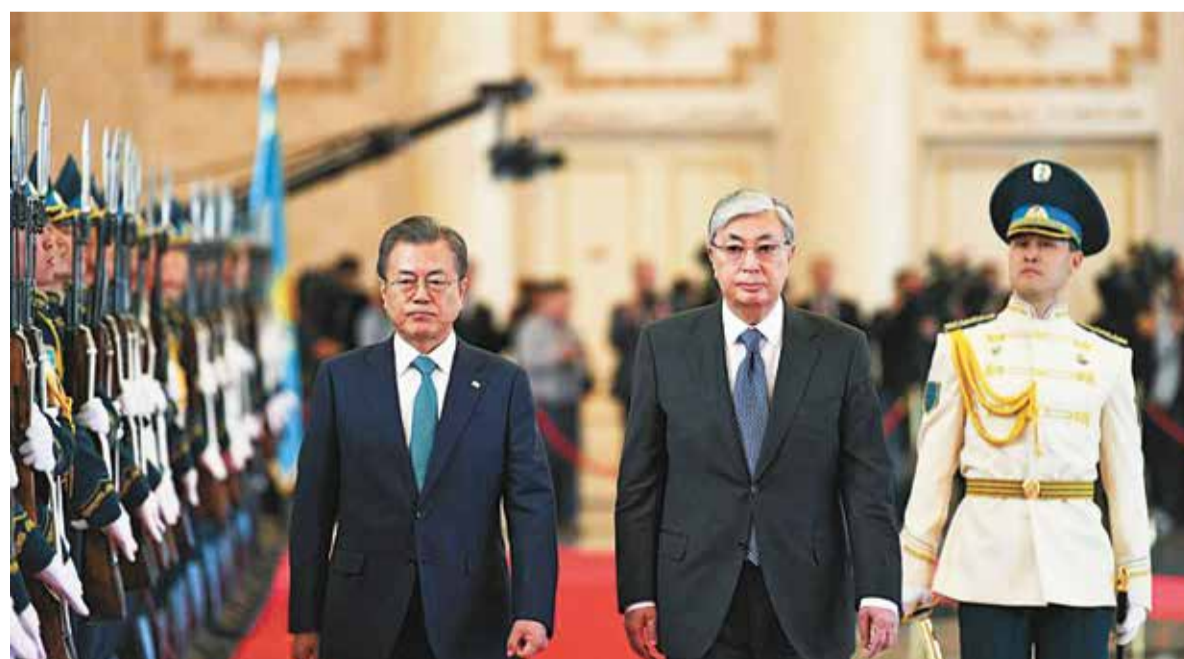
L-R: South Korean President Moon Jae-in and Kazakh President Kassym-Jomart Tokayev.