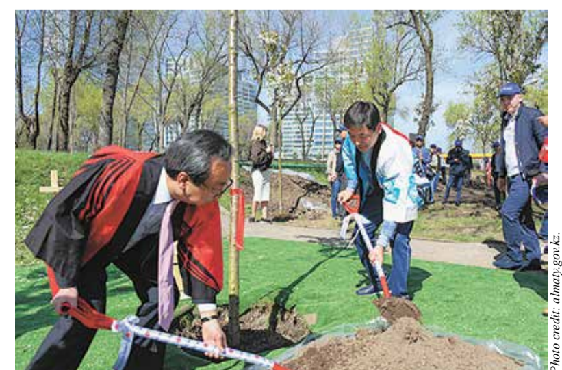
Tokyo Rope International President Sato Kazunori (L) and Almaty Akim (Mayor) Bauyrzhan Baibek planting the first sakura trees.

The day before the sakura planting, approximately 120 volunteers participated in the city's Jasy Meken programme, installing nearly 7,000 trees which saturated the city's heavily polluted air with oxygen. The species included ash, birch, linden, oak, maple, acacia and spruce, and the city akimat plans to plant more than 12,000 trees this spring.