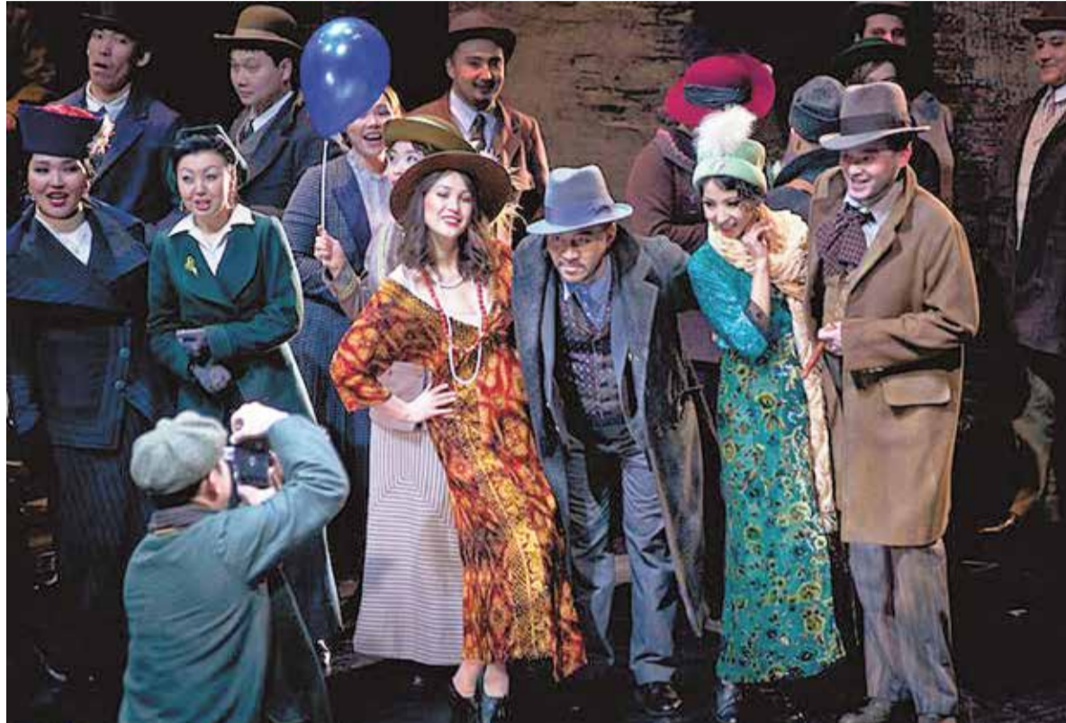
A scene from “La Bohème.”