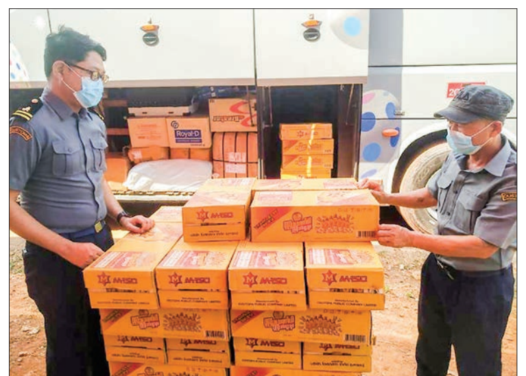
Customs officials check seized cartons of M-150 soft drinks at Mayanchaung checkpoint in Mon State on 19 March.

In addition, a combined inspection team led by the Department of Forest conducted inspections under the management of the Anti-Illegal Trade Task Force in Bago Region on the same day.