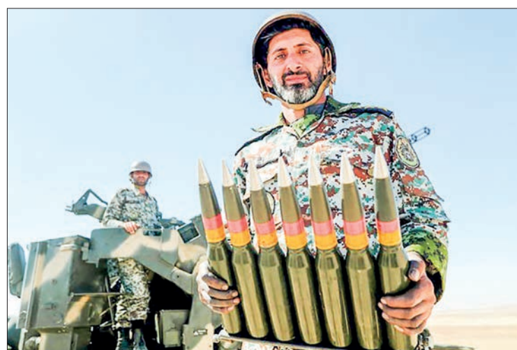
The Islamic Revolutionary Guard Corps is a branch of the Iranian Armed Forces, founded after the Iranian Revolution on 22 April 1979 by order of Ayatollah Ruhollah Khomeini.

It came the year after Trump unilaterally withdrew the United States from the nuclear deal, known formally as the Joint Comprehensive Plan