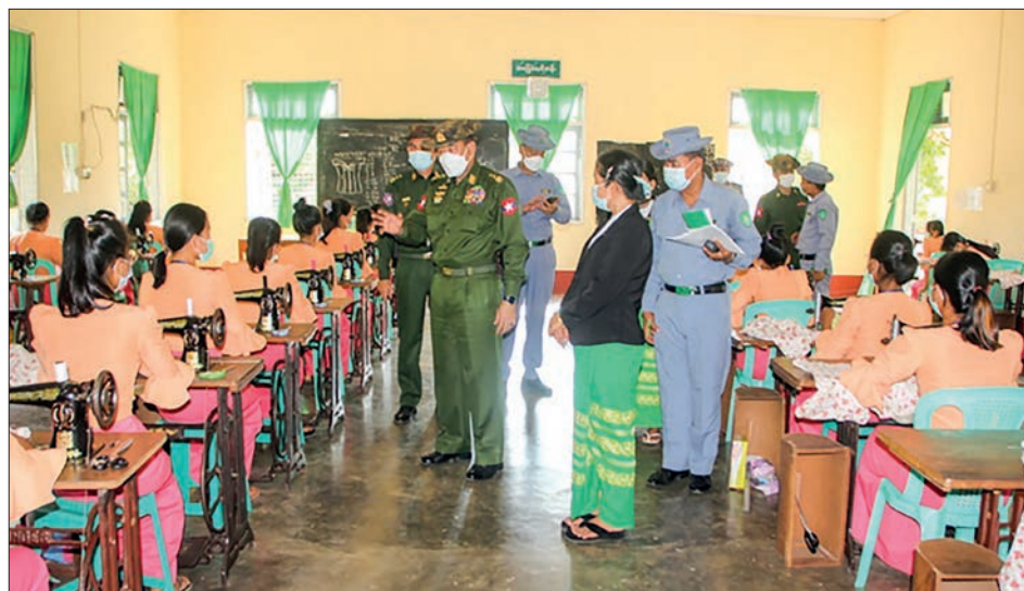
Union Minister Lt-Gen Tun Tun Naung visits women's Vocational Training School in Mudon of Mon State on 18 March.

UNION Minister for Border Affairs Lt-Gen Tun Tun Naung, together with Mon State Minister for Security and Border Affairs Col Nay Htut Oo, inspected the completion of repaved Wekali-Aaingshay Road, in Wekali village-tract, Thanbyzayat Township, Mon State, on the afternoon of 18 March.