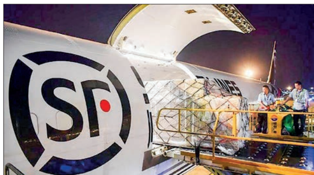
This undated file photo shows cargo being loaded onto a flight of SF Express Co Ltd in Shenzhen, Guangdong province.

THE southern Chinese metropolis of Shenzhen has launched a chartered air-freight service to Hong Kong, starting Saturday.