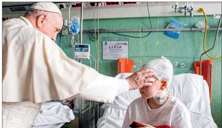
Pope Francis on Saturday visited Ukrainian children who have fled the Russian invasion and are being cared for at the Vatican's paediatric hospital in Rome. The Bambino Gesù hospital is treating 19 Ukrainian children.

THE Vatican has long played global mediator but has struggled to make its mark in the Ukraine conflict, walking a tightrope between its desire for peace and ties with the Russian Orthodox Church.