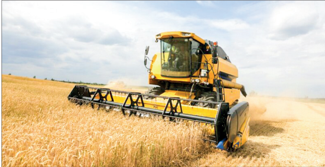
Ukraine is the fifth largest exporter of wheat, accounting for seven per cent of sales globally in 2019. A combine harvesting picks up the wheat on a field near the Krasne village, in the Chernihiv area, 120 km to the north from Kyiv, on 5 July 2019.

THE ongoing conflict between Russia and Ukraine is casting a heavy cloud over the Indian economy. The surge in international costs of commodities driven by the conflict is creating a drag on India, which is pursuing an economic recovery following two deadly waves of the COVID-19