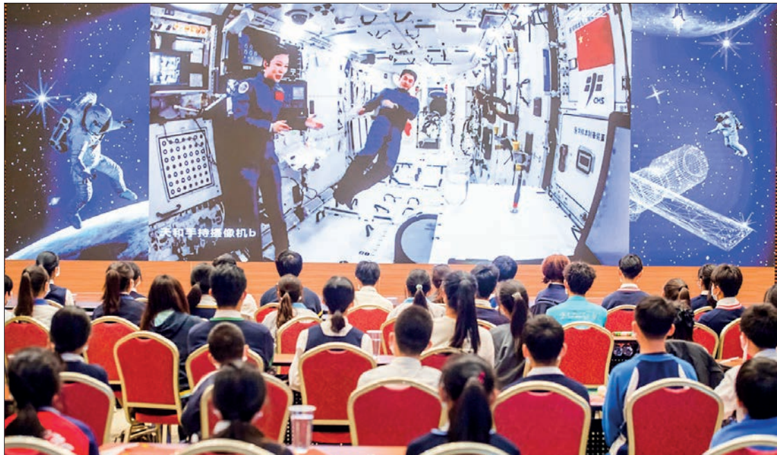
Shenzhou XIII crew members Wang Yaping (left) and Ye Guangfu give a lecture to students on 9 December 2021 from China's space station. During the class, fellow astronaut Zhai Zhigang introduced the special uniform Ye was wearing, saying it is called a "penguin jumpsuit".

THE second lecture from China's Tiangong space station is scheduled at 3:40 pm on 23 March, the China Manned Space