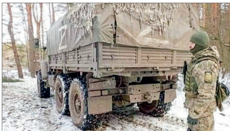
Russian Offensive Edges Deeper Into Kyiv, More Talks Planned.

Ukraine's defence ministry admitted it had "temporarily" lost access to the Sea of Azov while Deputy Prime Minister Iryna Vereshchuk said that Ukraine hopes to evacuate civilians on Saturday via 10 humanitarian corridors from cities and towns on the front line of fighting with Russian forces. Presidential Advisor Mykhailo Podolyak said on Friday that Ukraine's positions at the peace talks with Russia remain unchanged. — CGTN/Xinhua ■