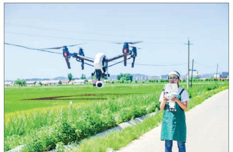
A worker checks the growing condition of rice with a drone at the Sanhe farm in Xingde Village of Huinan County, northeast China's Jilin Province.

Vigorous efforts should be made to expand the planting of soybean and oilseed crops to support coordinated devel-