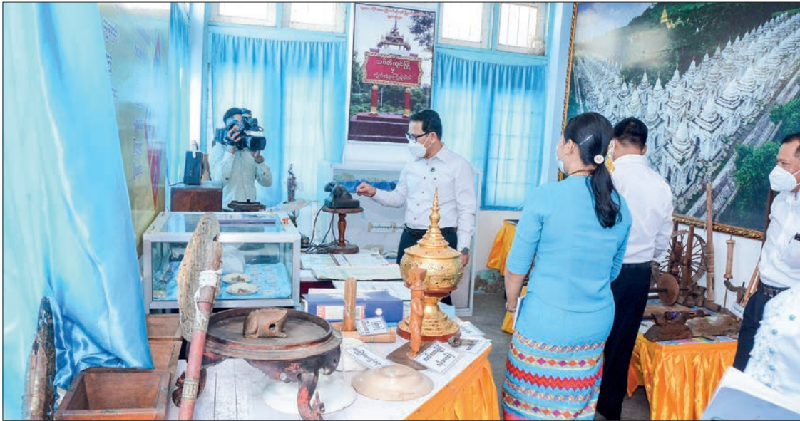
Union Minister for Information U Maung Maung Ohn views ancient objects kept in Yadanabon Amusement Park in Mandalay on 20 March.

UNION Minister for Information U Maung Maung Ohn and Mandalay Region Chief Minister U Maung Ko inspected the construction of Yadanabon Amusement Park in Mandalay and discussed recreation plans for the people yesterday.