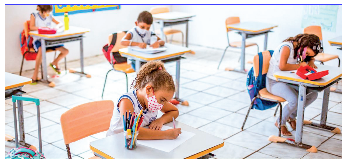
Return to in-person classes in September 2021 in Brazil. Safe reopening of schools in the northeastern state of Rio Grande do Norte, in Brazil.

The number of Covid-linked deaths continued to decline, shrinking 20 per cent to an av-