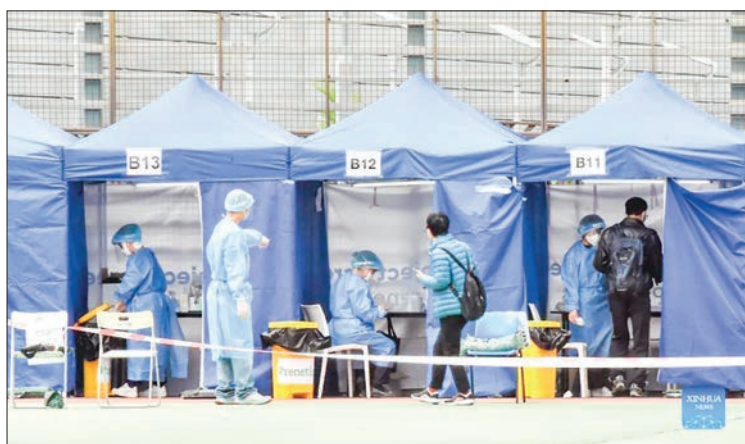
Citizens receive COVID-19 testing at a mobile testing station in a park in Hong Kong, south China, 10 February 2022.

Studies show that a booster jab is effective in preventing death or severe conditions, Lei noted, advising elderly people who have not been vaccinated and those who meet the conditions for booster immunization to get inoculated as soon as possible. Cautioning against relaxing precautions in the face of the still raging pandemic, Mi Feng called for earlier, faster and stricter implementation of the current measures for COVID-19 prevention and control. — Xinhua ■