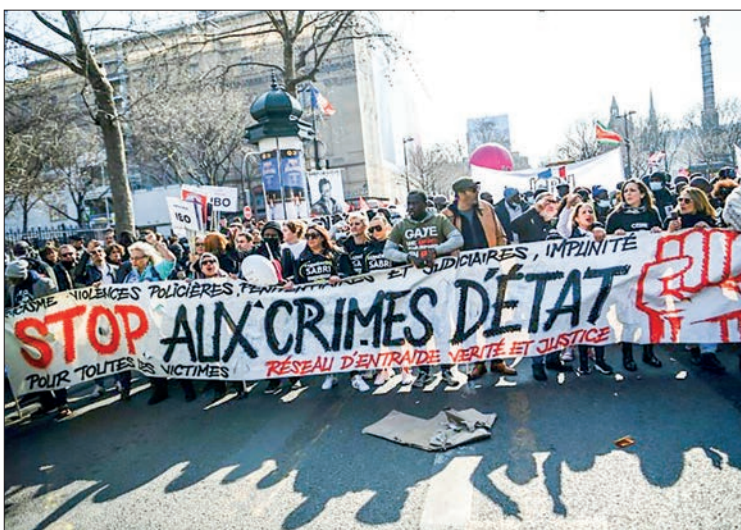
Police put the Paris turnout at 2,100, while organisers said at least 8,000 marched.

THOUSANDS of people in several French cities marched Saturday to protest racism and police brutality.