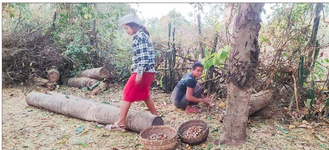
Local people are sorting tamarind with seeds in NyaungU Township.