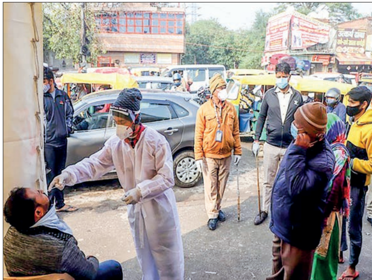
While several countries in the world are witnessing a fresh COVID-19 wave, India continued to witness a declining trend with daily infections dropping below the 2,000 mark on Sunday.

With 127 deaths recorded in the last 24 hours, the death toll of the country rose to 5,16,479. The case fatality rate is at 1.20 per cent. Meanwhile, India's COVID-19 vaccination coverage has exceeded 181.21 crores. A total of