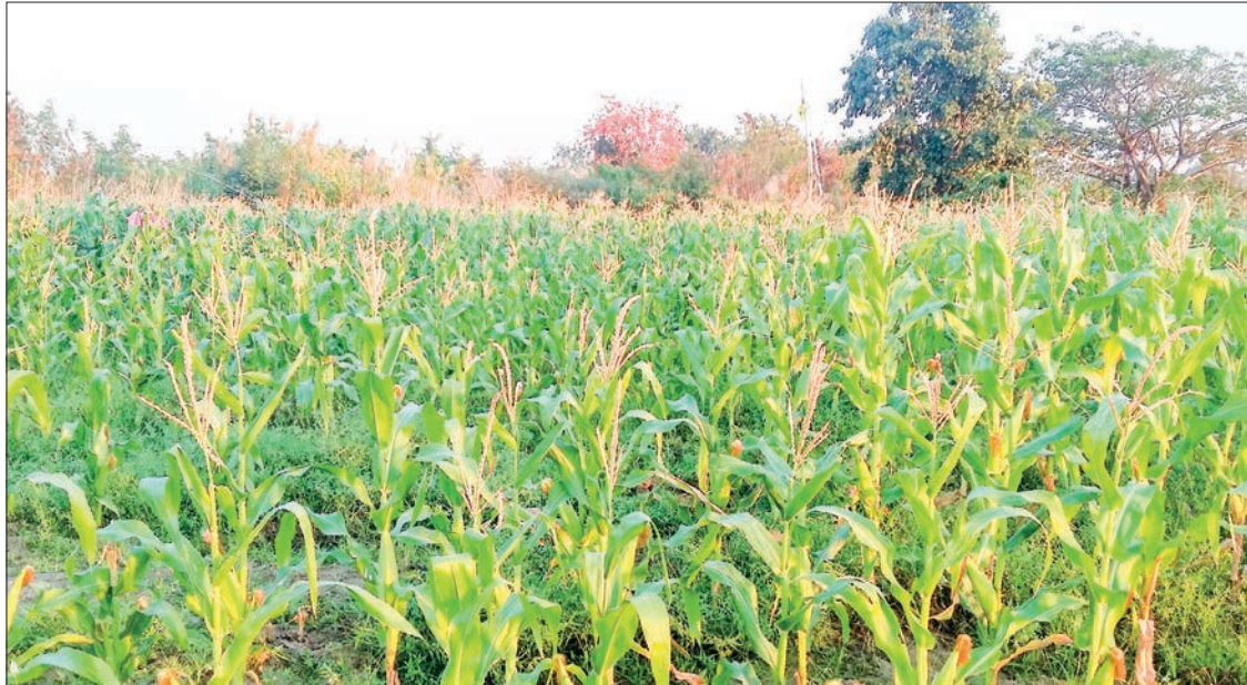
Corn plantations are thriving with buds in the farm.

corn is approximately K1,000 per viss (a viss equals to 1.6 kg) and K48,500-K49,000 per bag. The prevailing price is down by K100-K150 per viss compared to the rate recorded in the early March 2022, Yangon market's data indicated.