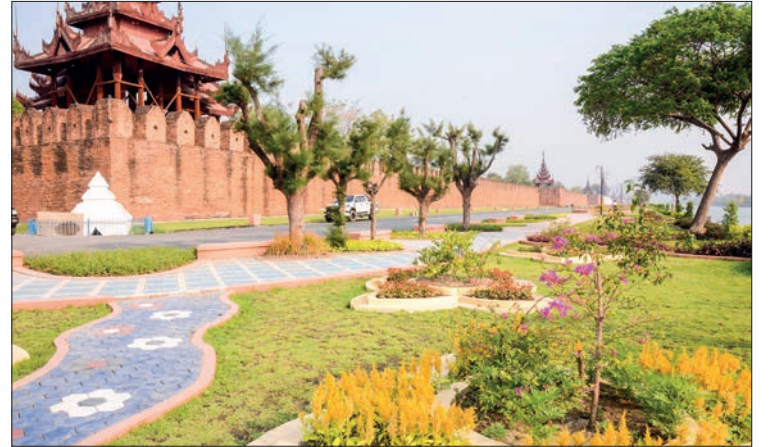
A scene depicts pleasant view of Yadanabon Amusement Park in Mandalay.

Afterwards, the Union Minister met with staffs from the District Information and Public Relations Department in Pyigyidagun Township, discussed matters to step up youth development activities, to open vocational training courses for young people and to hold sports events, and provided cash assistance and foods.—MNA