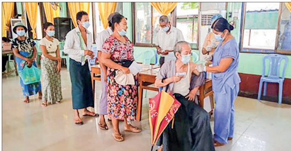
Local people are seen in a queue to receive inoculation of COVID-19 vaccine in Bago Township.

On 20 March, doctors and nurses from public hospitals, medical teams from the Tatmadaw, relevant healthcare workers in collaboration with volunteers injected COVID-19 vaccines to 44 people from Monghkat Township in Shan State (East), 350 people from Myeik Township in Taninthayi Region, 25,626 people from 26 townships in Ayeyawady Region, 6,218 people from five townships in Rakhine State, 5,620 people from seven districts in Mandalay Region and 830 people from Htantabin and Bago townships in Bago Region, respectively. It is reported that officials from the respective Military Commands visited the sites and coordinated the necessary work. —MNA