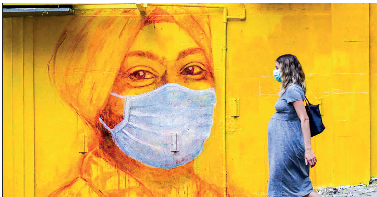
A pregnant woman wearing a face mask as a precautionary measure walks past a street mural in Hong Kong, on 23 March 2020.

A small preliminary study from Northwestern Medicine has shown that a blood test may identify the risk of stillbirth and placental infection in pregnant individuals who have had COVID-19.