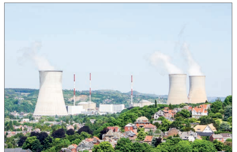
The Tihange Nuclear Power Station is one of two nuclear energy production sites in Belgium and contains 3 nuclear power plants.

phase-out of nuclear power has been enshrined in Belgian law since 2003 and the decision to