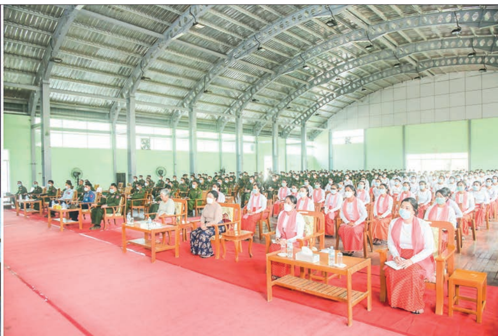
Vice-Chairman of the State Administration Council Deputy Commander-in-Chief of Defence Services Commander-in-Chief (Army) Vice-Senior General Soe Win meets officers, other ranks and families of Mongmaw Station of Central Command on 20 March.

COMMANDERS need to always consider life security of servicemen and families, said Vice-Chairman of the State Administration Council Deputy Commander-in-Chief of Defence Services Commander-in-Chief (Army) Vice-Senior General Soe Win at the meeting with officers,