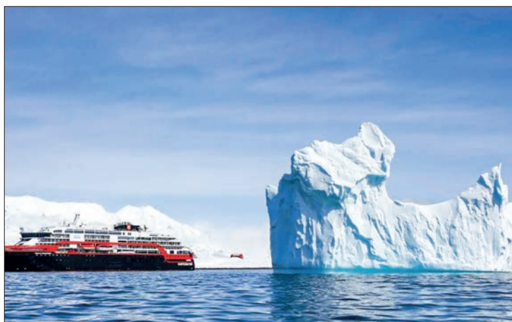
Normally, temperatures fall with the end of the southern summer, but the Dumont d'Urville station on Antarctica registered record temperatures for March with 4.9C (40.82F), at a time of year when normally temperatures are already sub-zero.

EASTERN Antarctica has recorded exceptionally high temperatures this week, more than 30 degrees Celsius above normal, say experts.