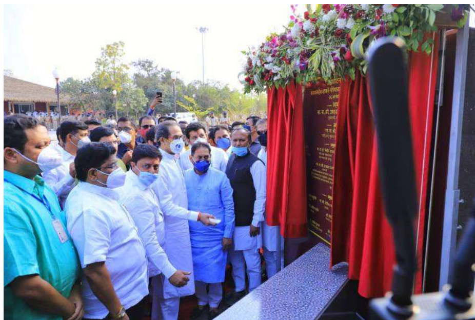
Hon. Chief Minister Shri. Uddhav Balasaheb Thackeray at Gorewada Zoo