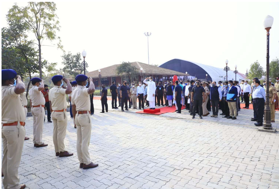
Hon. Chief Minister Shri. Uddhav Balasaheb Thackeray at Gorewada Zoo

Like the world all over the park has faced huge challenge due to Covid-19 pandemic in its first year.