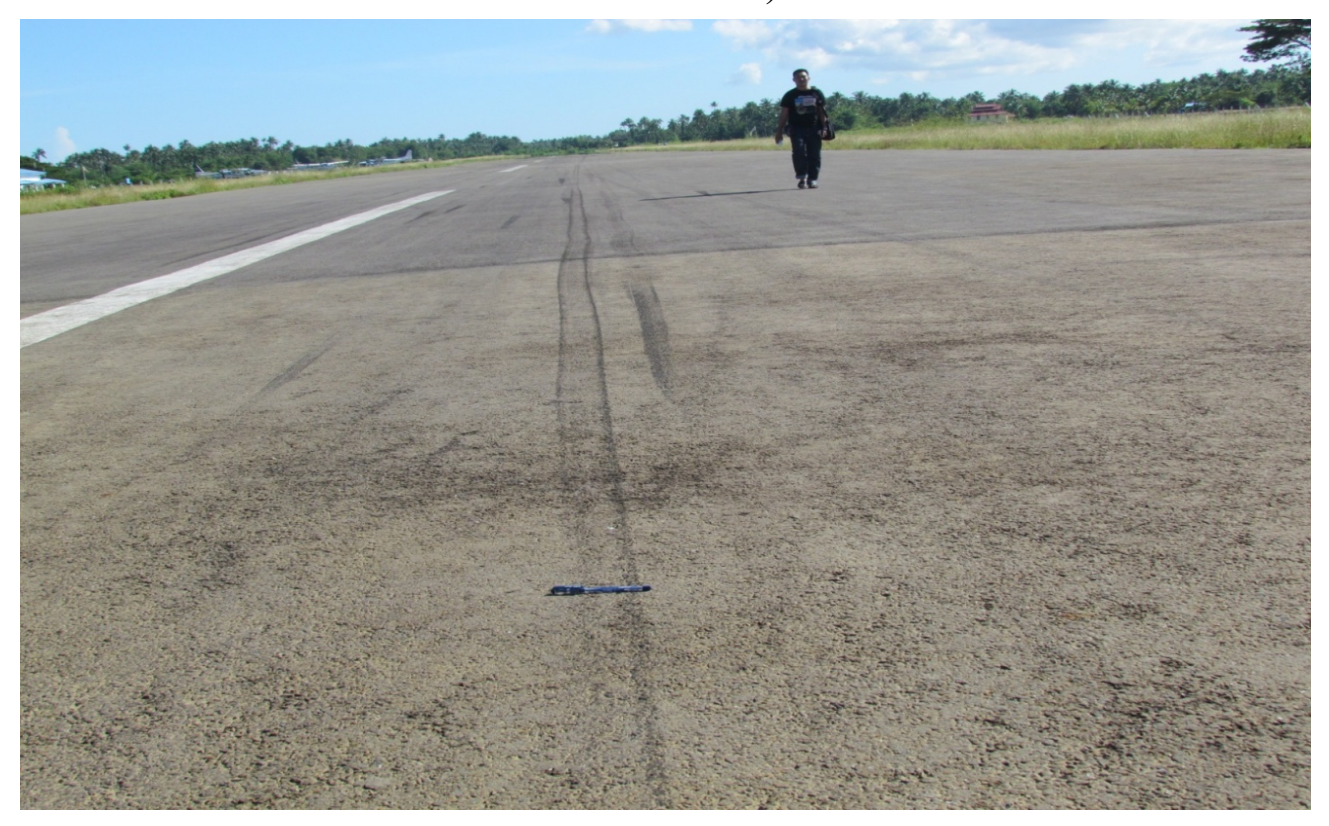
Figure:9 The Ground Mark of Right Hand Main Wheel (Viewed from Runway-16 to Crash Site )