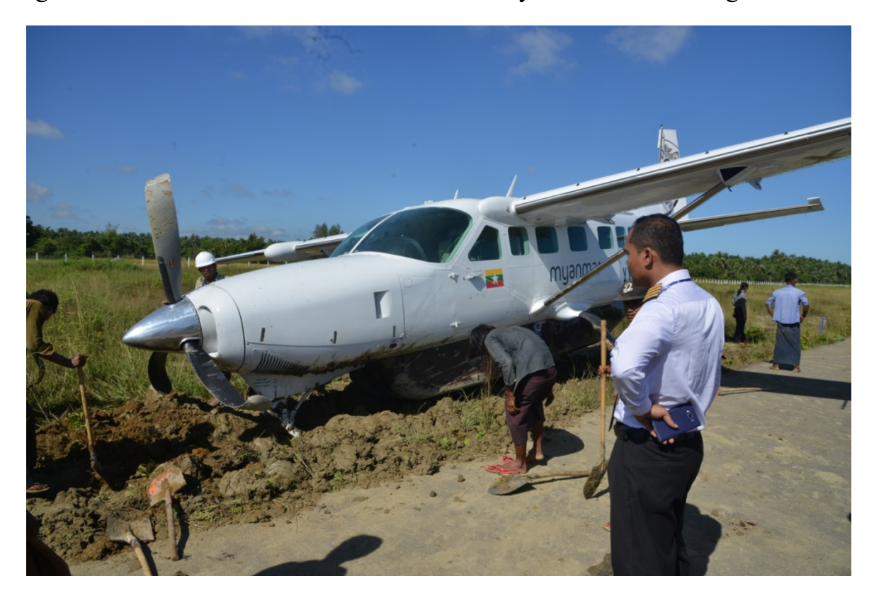
Figure: 3 The aircraft came to rest on the runway shoulder at the edge of the runway

Figure: 2 The aircraft came to rest on the runway shoulder at the edge of the runway