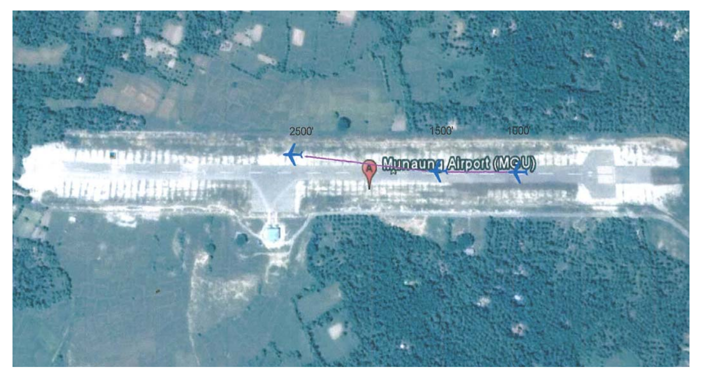
Figure :1 Layout of Incident Site

The route of the Cessna Grand Caravan (XY-AMC) on that day was Yangon-Manaung- Sittwe- Manaung- Yangon.