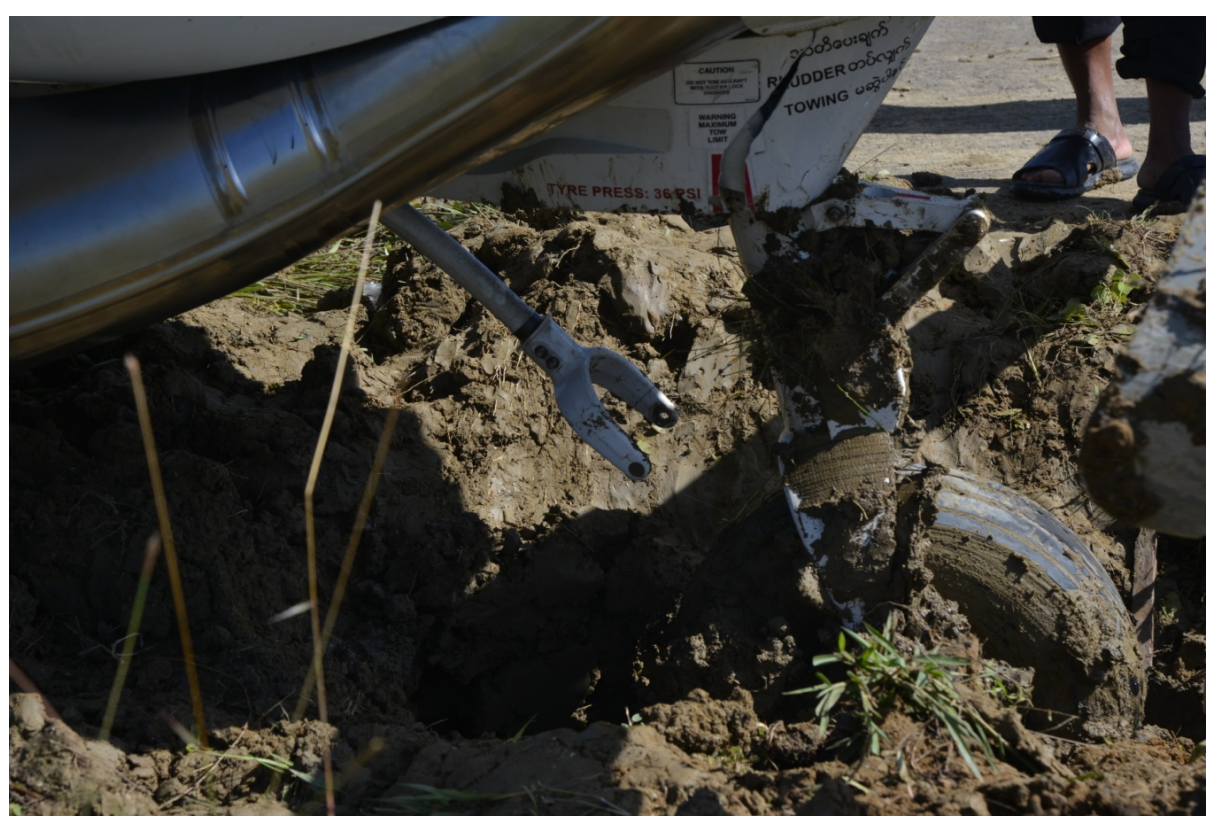
Figure :4 The Nose Wheel bobbed down with broken yoke