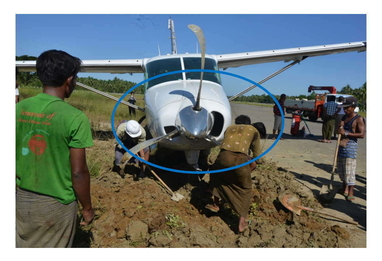
Figure: 2 The aircraft came to rest on the runway shoulder at the edge of the runway