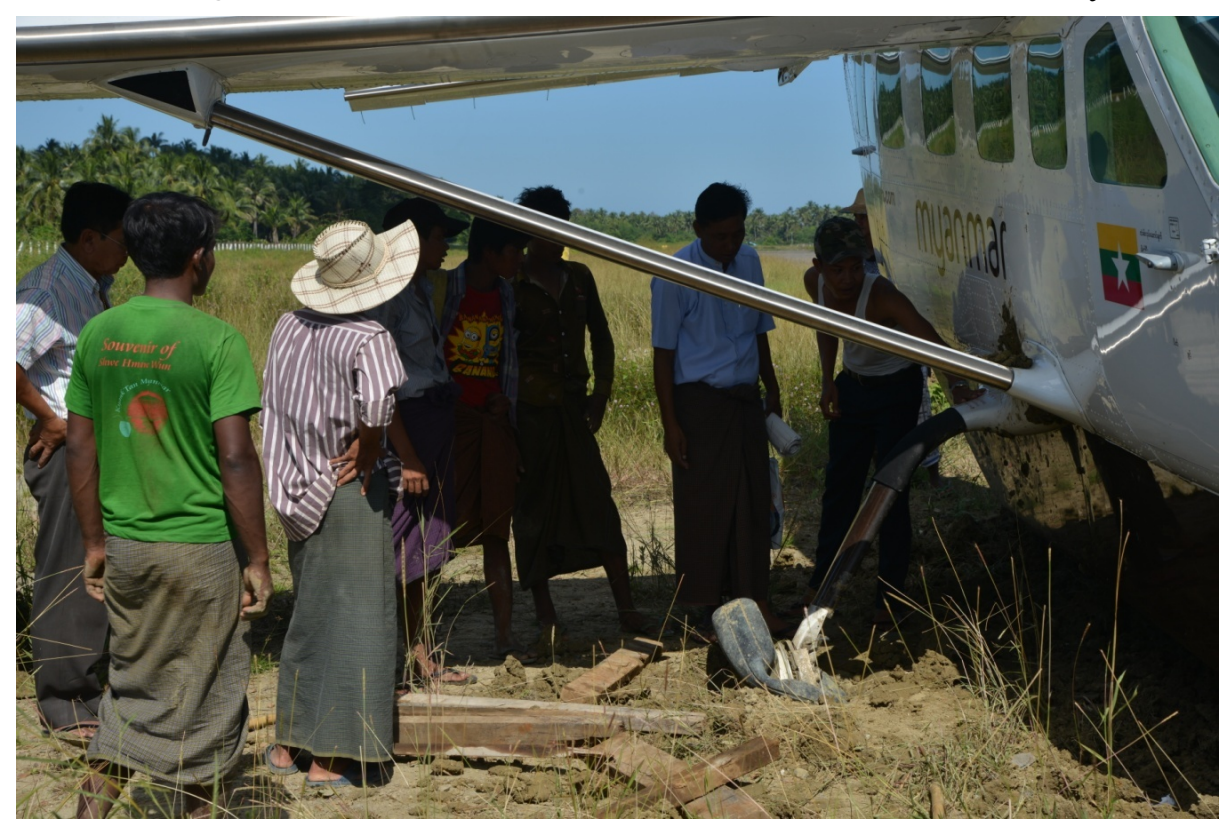
Figure : 5 The damaged the right hand Main Wheel