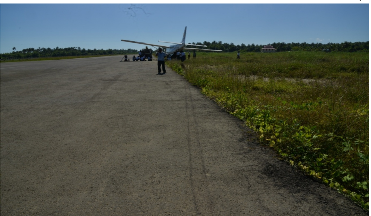
Figure :8 The Ground Mark of Right Main Wheel (Viewed from Runway-16 to Crash Site )