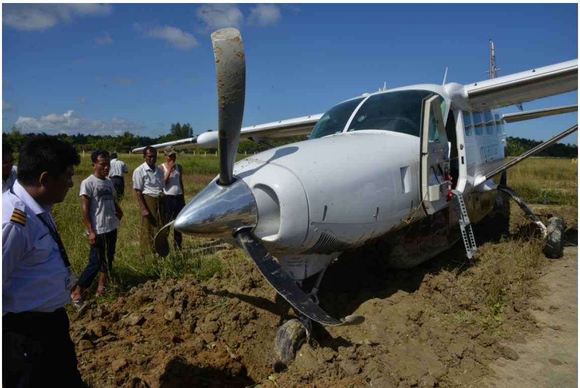
Figure:10 The twisted and damaged propeller