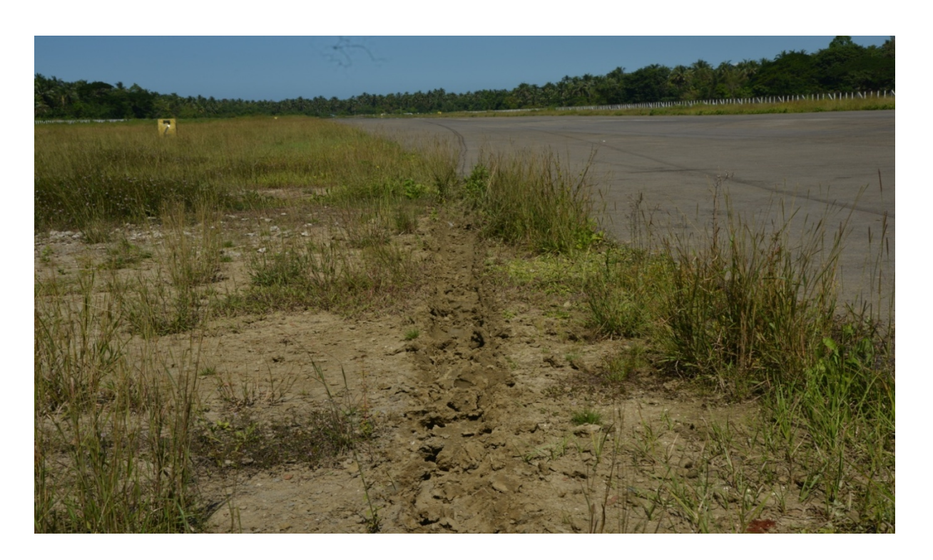
Figure :7 The Ground Mark of Right Hand Main Wheel (Viewed from Crash Site to Runway-16)