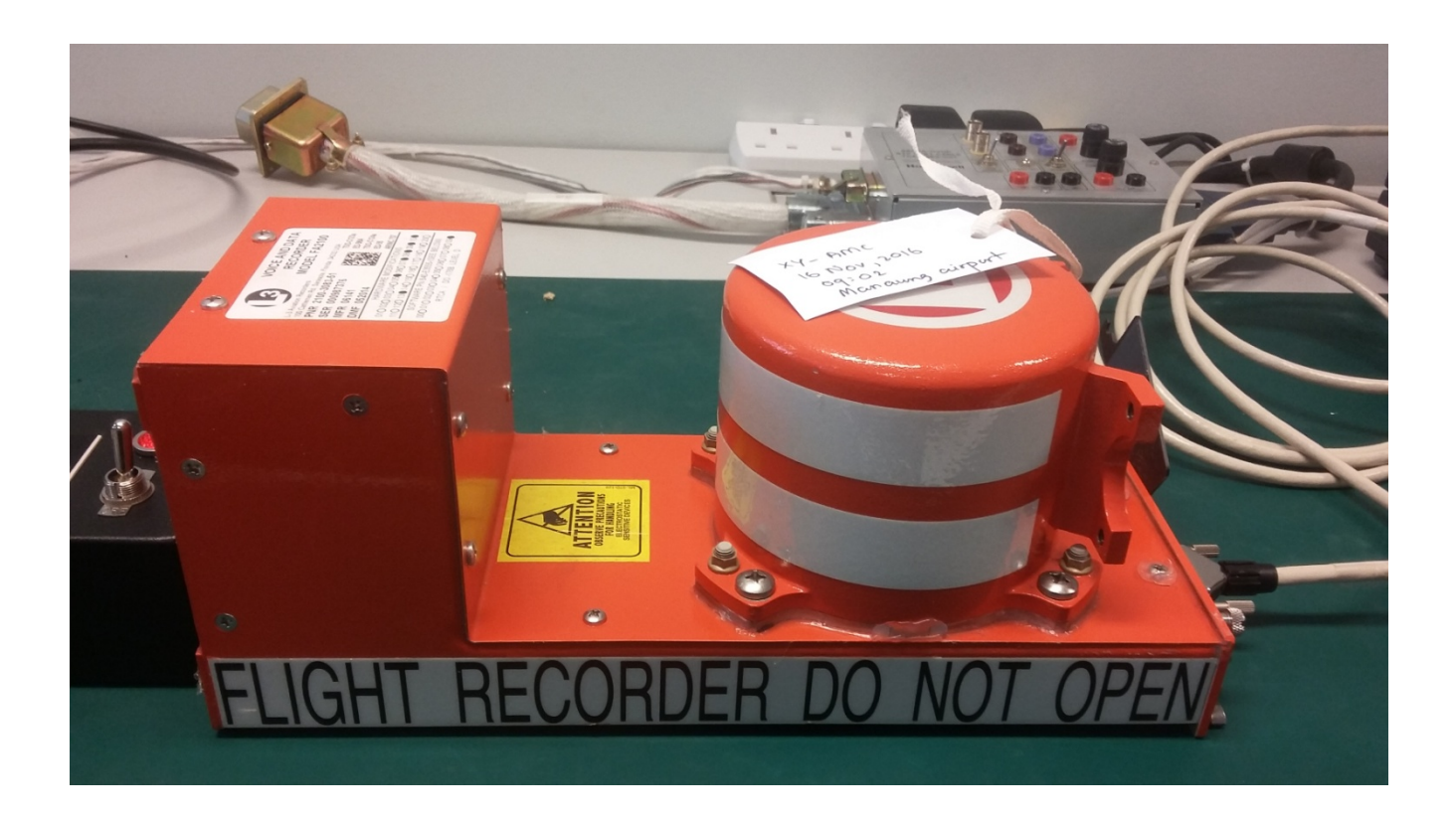
Figure: 14 Cockpit Voice Data Recorder(CVDR)