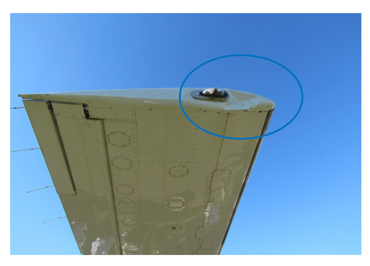
Figure:11 The dented Right Hand wing tip of the aircraft