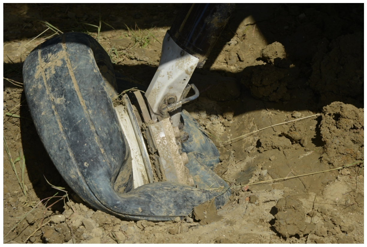
Figure :6 The Closer view of the damaged right hand Main Wheel