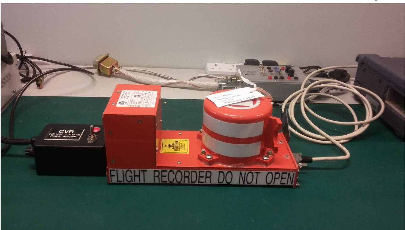
Figure: 13 Cockpit Voice Data Recorder (CVDR)