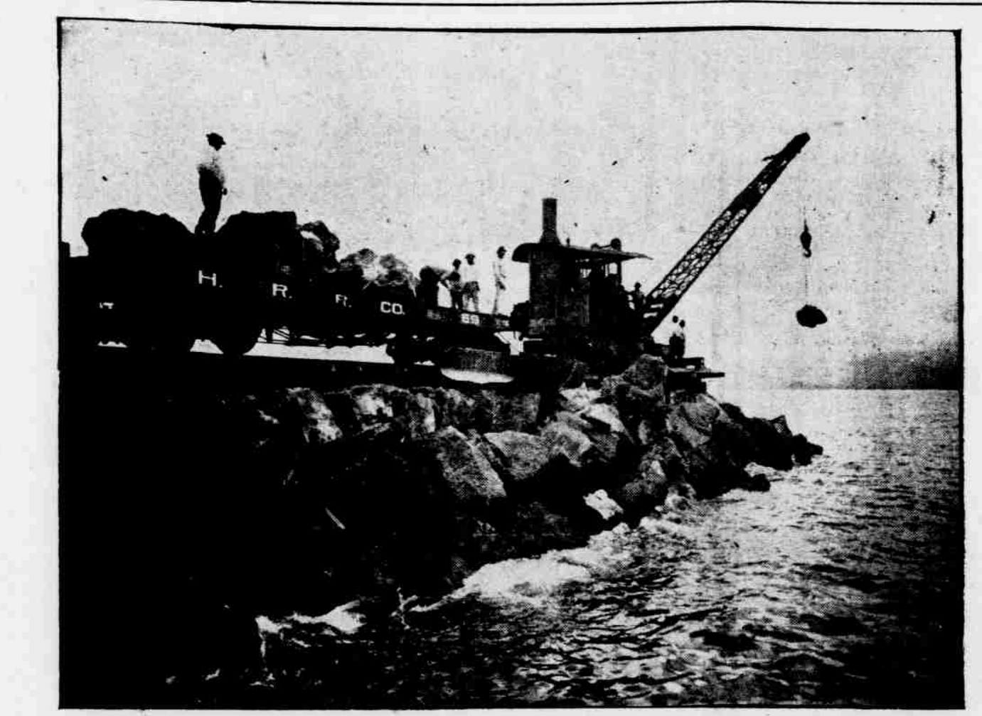
CONSTRUCTION WORK ON HILO BREAKWATER.