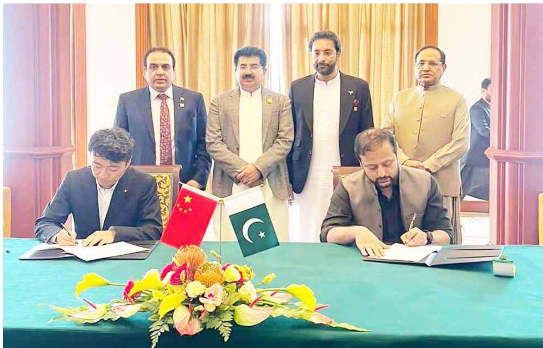
BEIJING: Chairman Senate of Pakistan, Muhammad Sadiq Sanjrani alongwith the Pakistani delegation witnessing signing ceremony of a memorandum of understanding (MOU) between a leading Chinese Company Tgoad and the Rec Group of Pakistan China.

Clashes between Hezbollah and Israeli forces along the Lebanese border followed the start of the conflict in Gaza, which has been under Israeli bombardment and a blockade since Oct. 7. —APP