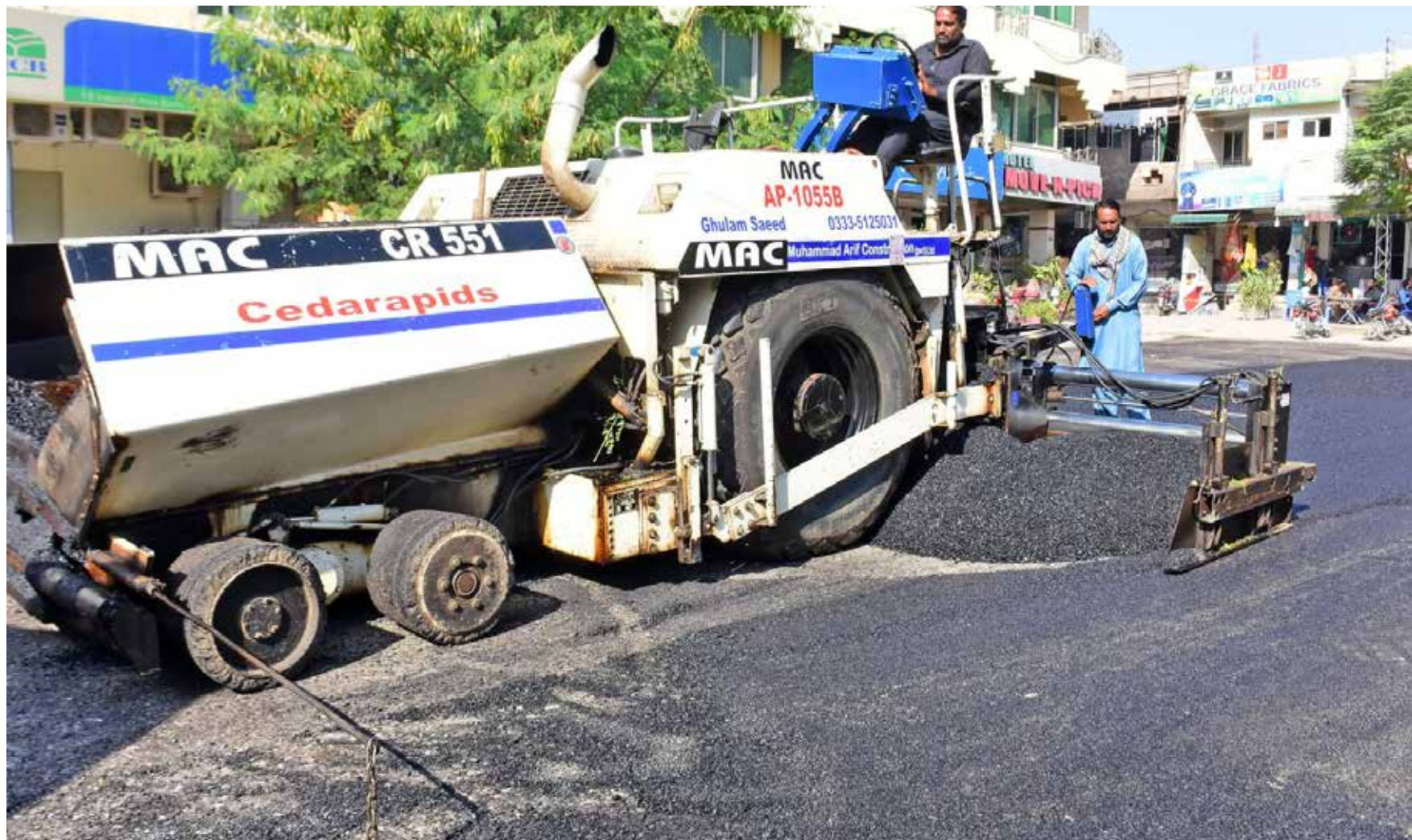
ISLAMABAD: Laborers are busy in the carpeting of the road of parking area at sector 1-9 in Federal Capital. —ONLINE

ISLAMABAD, Oct 25 (APP): Indus River System Authority (IRSA) on Wednesday released 89,200 cusecs water from various rim stations with inflow of 64,700 cusecs. According to the data released by IRSA, water level in River Indus at Tarbela Dam was 1528.29 feet and was 130.29 feet higher than its dead level of 1,398 feet. Water inflow and outflow in the dam was recorded as 32,000 cusecs and 40,000 cusecs respectively. The water level in River Jhelum at Mangla Dam was 1207.55 feet, which was 157.55 feet higher than its dead level of 1,050 feet. The inflow and outflow of water was recorded 8,500 cusecs and 25,000 cusecs respectively. The release of water at Kalabagh, Taunsa, Guddu and Sukkur was recorded as 38,400, 45,000, 37,900 and 10,300 cusecs respectively. Similarly, from River Kabul, a total of 11,300 cusecs of water released at Nowshera and 4,900 cusecs released from River Chenab at Marala.—APP