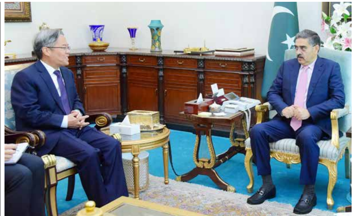
ISLAMABAD: Ambassador of China to Pakistan, Jiang Zaidong calls on the Caretaker Prime Minister, Anwaar-ul-Haq Kakar.