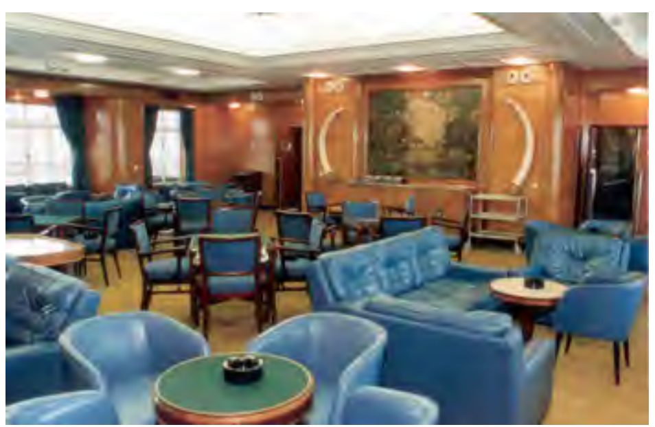
Smoking room of SS Uganda

As the Uganda left the dock, Swamiji found himself surrounded by Haj pilgrims from Cape Town on their way to Mecca! Swamiji was even more pleased to discover the hajji s would not eat meat on their pilgrimage. "Same God, different tongues," he noted.