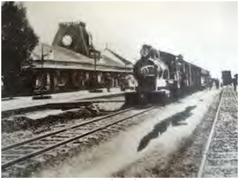
"Lunatic Express", Uganda Railway