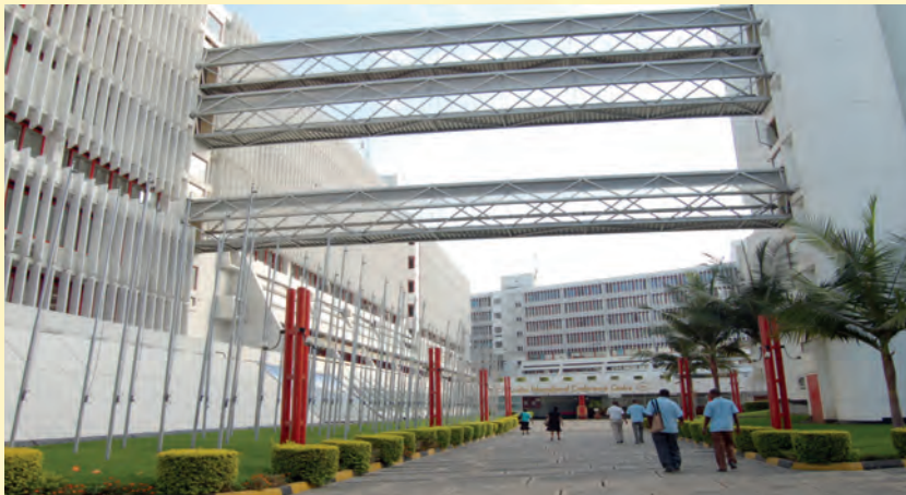
The main building of the AICC as seen from the front side

Several top-end hotels and tour operators, and some mid-range establishments accept credit and debit cards. Otherwise, credit/debit cards (primarily Visa and MasterCard) are useful for withdrawing money at ATMs.