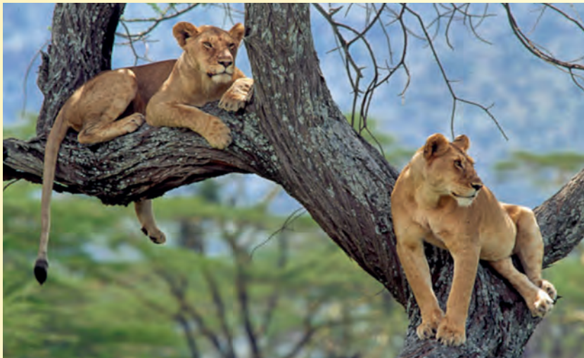
Lions resting in Manyara National Park