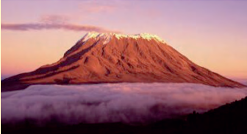
Kilimanjaro Mountain at Sunset

More information about places of interest in Arusha and other areas in Tanzania can be found in the following links: