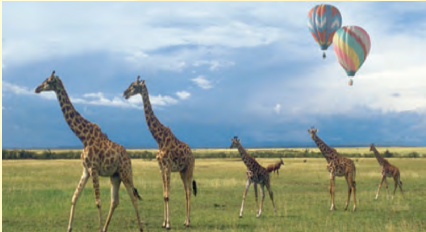
Giraffe grazing in Serengeti Park