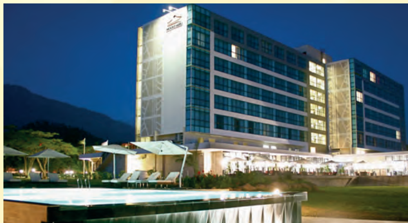
Mont Meru Hotel .