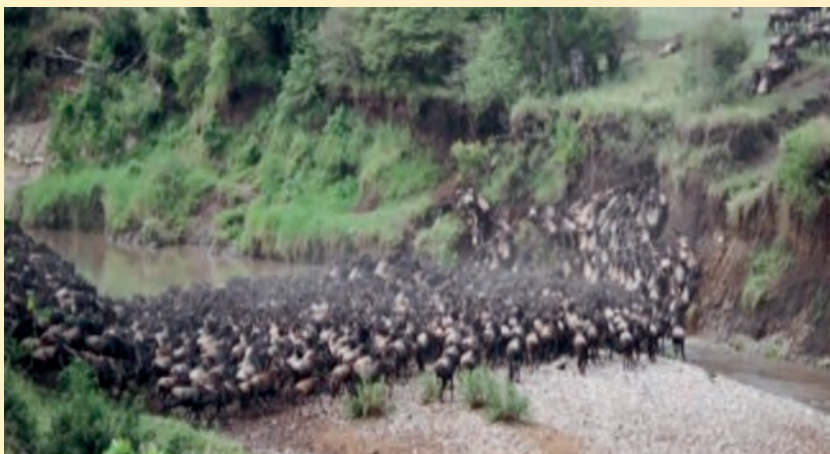
Wildlife crossing a river in Ngorongoro