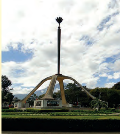
Uhuru Declaration tower/ Arusha torch found in Arusha City Centre