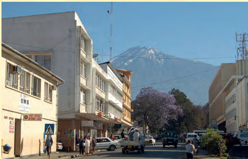
Mount Meru as seen from Arusha town

Below are some of the main features of Arusha City: