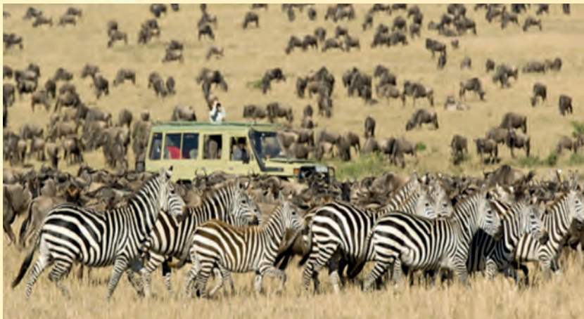
Zebras in the Serengeti enjoying their lunch