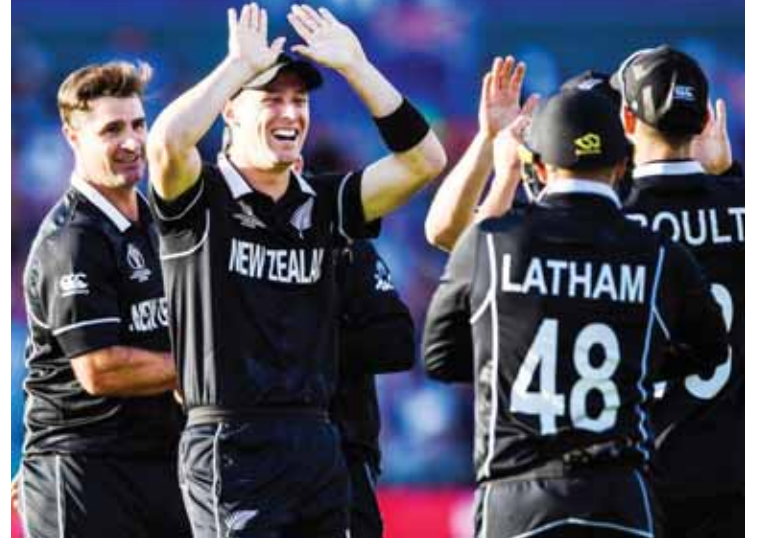
New Zealand players celebrate after dismissing Pakistan batsman during World Cup game at Edgbaston on Wednesday

and foremost, that's probably how they view themselves and they put that on display. I think New Zealand were feeling good about themselves going into the mid-innings break on the back of that.