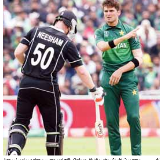
.limmv Neesham shares a moment with Shaheen Afridi during World Cup game

"Obviously, the way Babar and Sohail batted didn't allow us to get some momentum and try to get into their middle order and that was the difference," he