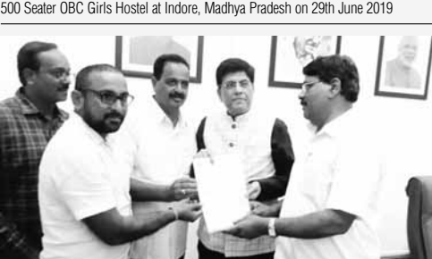
FCV Tobacco Farmers appeal to Piyush Goyal, Minister of Commerce and other concerned Ministries to bring cigarette taxation to pre-GST level and protect their