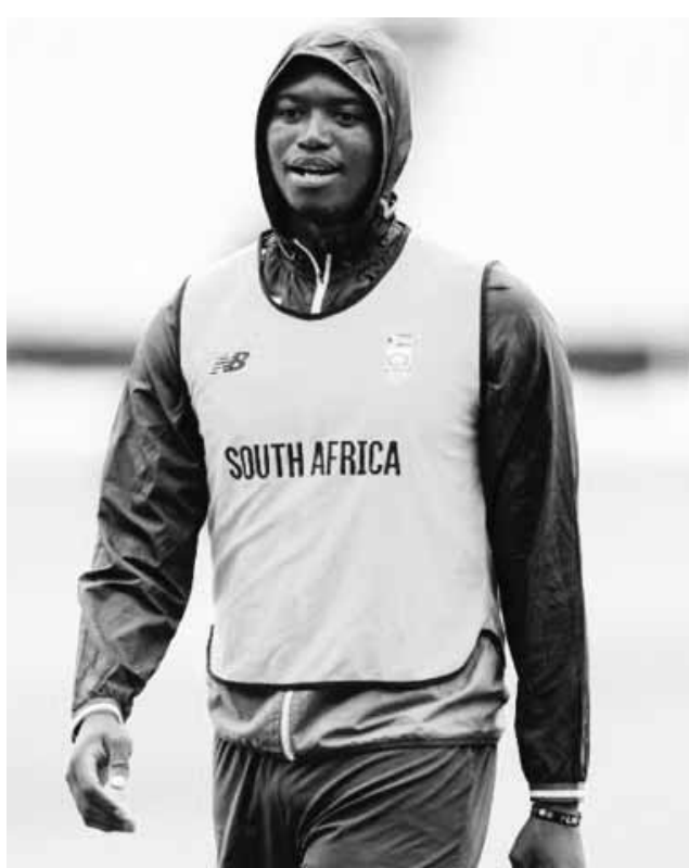
South African pacer Lungi Ngidi during team's practice session