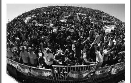
Indian fans cheer for their team at Old Trafford in Manchestel

Sri lanka vs South Africa VENUE: Riverside Ground, Chester-le-Street