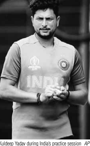
a big advantage over lot of other Kuldeep Yadav during India's practice session

teams. They have got two quality wrist spinners (Kuldeep and Chahal), who can be match-winners. India are brilliantly placed at the moment, they have got lot of fire power in different departments and I expect them to certainly get to the semi-finals and possibly the final," Hussey, an ESPN Cricinfo expert, added.