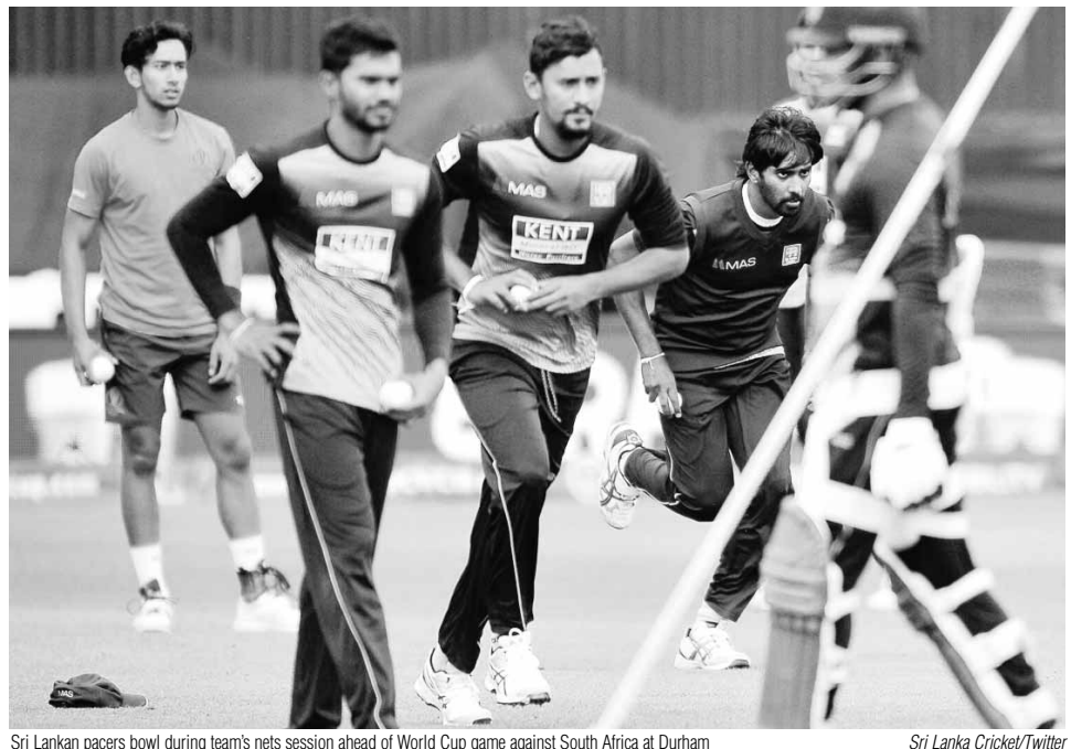
Sri Lankan pacers bowl during team's nets session ahead of World Cup game against South Africa at Durham

High on confidence after beating England, Islanders face SA test