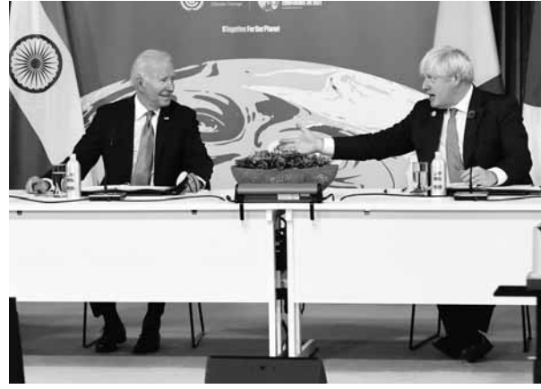
British Prime Minister Boris Johnson and US President Joe Biden attend the COP26 Summit at the SECC in Glasgow, Scotland on Tuesday

public and private funds have been pledged toward the plan. "With today's unprecedented pledges, we will have a chance to end humanity's long history as nature's conqueror, and instead become its custodian," British Prime Minister Boris Johnson said. "Let's end this great chainsaw massacre by making conservation do what