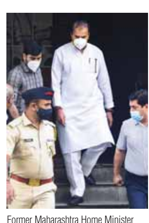
Former Maharashtra Home Minister Anil Deshmukh being taken to a hospital for his medical check-up in Mumbai on Tuesday

After 12-long hours of Aintense grilling, the Enforcement Directorate (ED) placed Maharashtra's former Home Minister Anil Deshmukh under arrest in the early hours of Tuesday in the alleged money laundering case linked to the charges of extortion made against him by Mumbai's former Police Commissioner Param Bir Singh. Later in the day, a sessions court remanded Deshmukh in ED's custody till November 6.