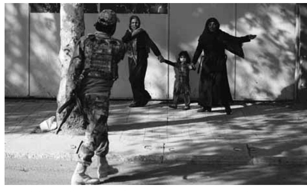
Taliban fighter sends people away after an explosion on Tuesday

"All the attackers are dead. The attack was initiated by a suicide bomber on a motorcy-