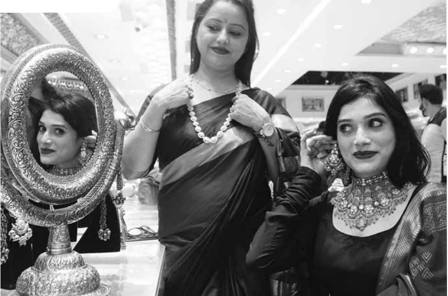
A woman tries gold ornaments on the occasion of Dhanteras, in New Delhi