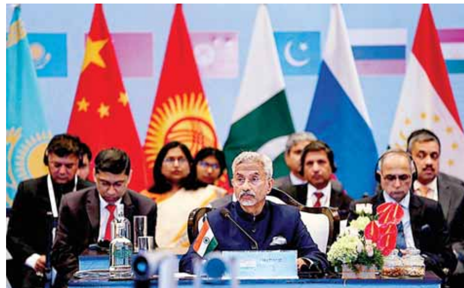
External Affairs Minister S Jaishankar during the Shanghai Cooperation Organisation (SCO) Foreign Ministers' meeting in Goa on Friday

"Terrorism continues to threaten global security. Let's not get caught up in weaponising terrorism for diplomatic point scoring. When I speak on this topic, I do so not only as the Foreign Minister of Pakistan whose people have suffered the most in terms of number of attacks and number of casualties. I also speak as the son whose mother was assassinated at the hands of terrorists," the Pakistan foreign minister said. Former Pakistan prime minister Benazir Bhutto was assassinated by a suicide bomber in Rawalpindi in 2007.