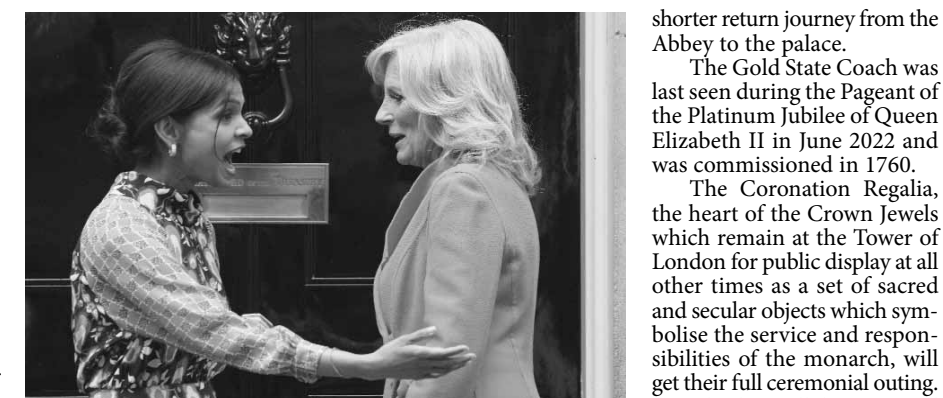
Akshata Murty wife of the British Prime Minister greets the US First Lady Jill Biden on the doorstep of 10 Downing Street in London on Friday. The First Lady is in London to attend the Coronation of King Charles III, on Saturday

While Lord Indrajit Singh, 90, will represent the Sikh faith and present the Coronation Glove, Lord Syed Kamall, 56, of Indo-Guyanese heritage, will represent the Muslim faith and present the Armills or a pair of bracelets. Lord Narendra