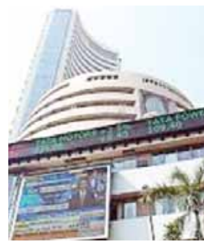
Finserv, HCL Technologies, Infosys, Wipro and NTPC were the other major laggards.

IndusInd Bank, Tata Steel, Kotak Mahindra Bank, Mahindra & Mahindra, Bajaj