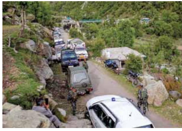
Security personnel near the site of an encounter with terrorists in Kandi area of Rajouri district on Friday

Earlier, on April 20, five Indian soldiers were killed in action after a group of terror-