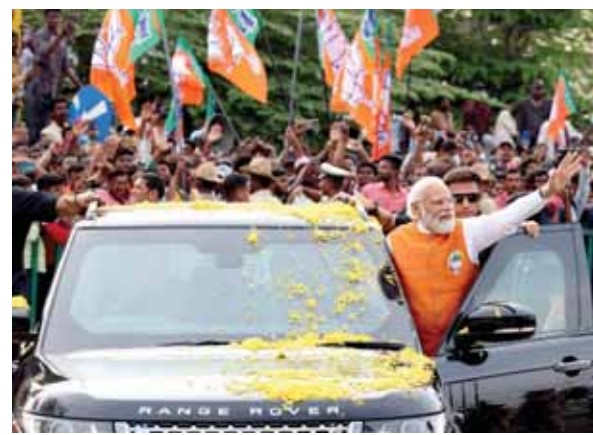
Prime Minister Narendra Modi greets the crowd during a roadshow ahead of the Karnataka Assembly elections, in Tumakuru, on Friday

At Tumakuru in the east-central part of the Mysuru rally, Modi also said, "The BJP is returning to power in Karnataka with a thumping majority." Addressing a public rally in Bellary, Modi alleged that the Congress had opposed the film "The Kerala Story", which, according to him, exposes a terror conspiracy.