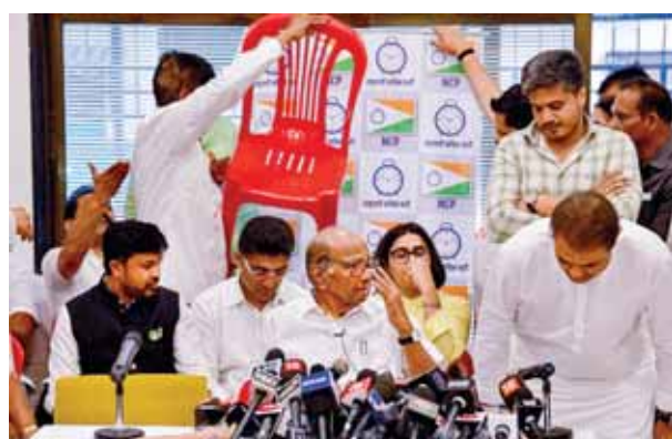
National Congress Party chief Sharad Pawar, with party leaders, addresses the media at the YB Chavan Centre in Mumbai on Friday