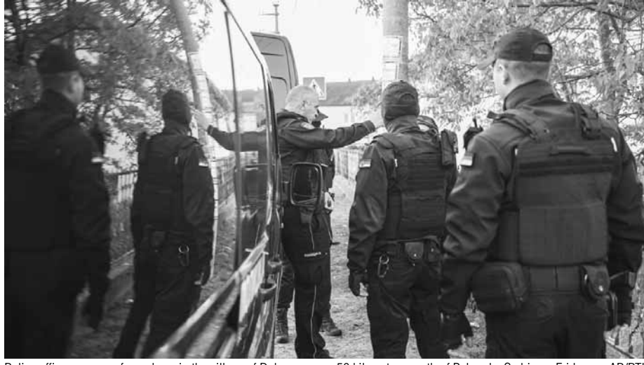
Police officers prepare for a chase in the village of Dubona, some 50 kilometers south of Belgrade, Serbia on Friday.

The last mass shooting before this week was in 2013, when a war veteran killed 13 people in a central Serbian village. Late Thursday, an attacker shot at people in three villages near Mladenovac, some 50