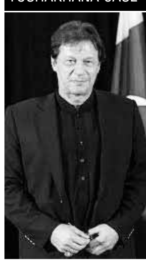
the Pakistan Tehreek-e-Insaf (PTI) party in person on the day of the indictment.

Earlier, the court had fixed February 7 to indict him but the process was deferred several times as Khan was not present and his lawyers also pressed to decide the issue of