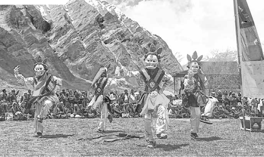
Artists perform Lama Gana Cham mask dance on the auspicious occasion of Buddha Jayanti in Lahaul-Spiti