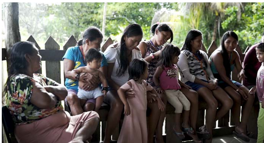
Unity among indigenous leaders is key to their fight.

The fight against these projects brings about a lot of problems, as was confirmed by the interviewees. Large infrastructure projects are plagued by co-optation (3.4 Co-optation) which divides opinions and ends up causing internal conflict, which is deliberately manipulated to weaken the unity amongst the indigenous peoples and thereby get the projects through.