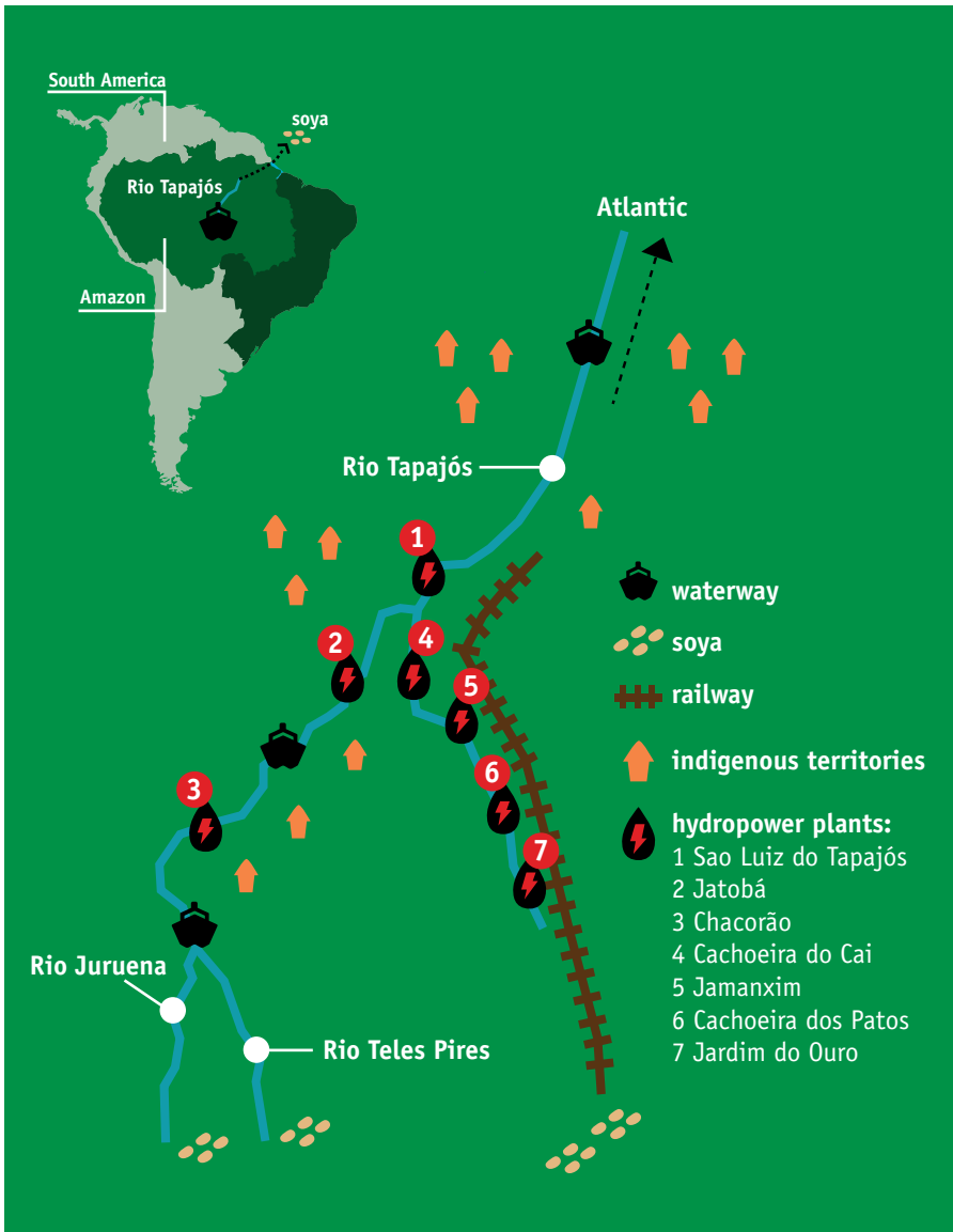
Figure 3: Map of the planned infrastructure projects