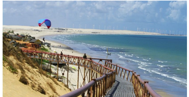
Canoa Quebrada Protection Area (Ceará)