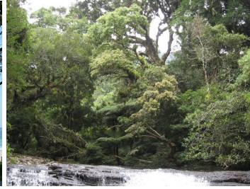
Left: Capivara-Monos Environmental Protection Area (SP) Center: Coastal Environmental Protection Area (RJ) Right: Caraá Environmental Protection Area (RS)