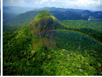
Left: Unini River Extractive Reserve (Amazonas)