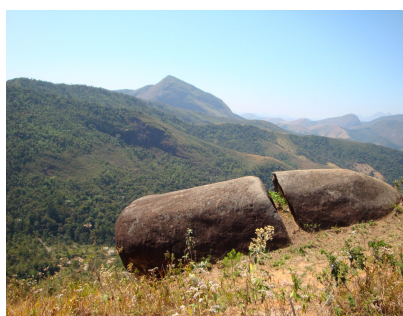
Left: Templo dos Pilares Municipal Natural Park