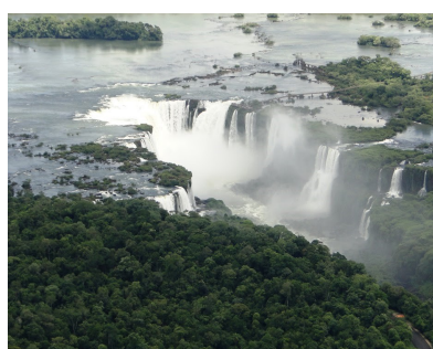
Left: Arraial do Cabo Marine Extractive Reserve (RJ)