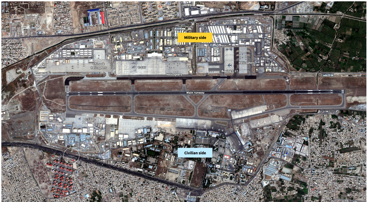
Satellite Overview of OAKB showing Mil side/Civil side of Kabul airport