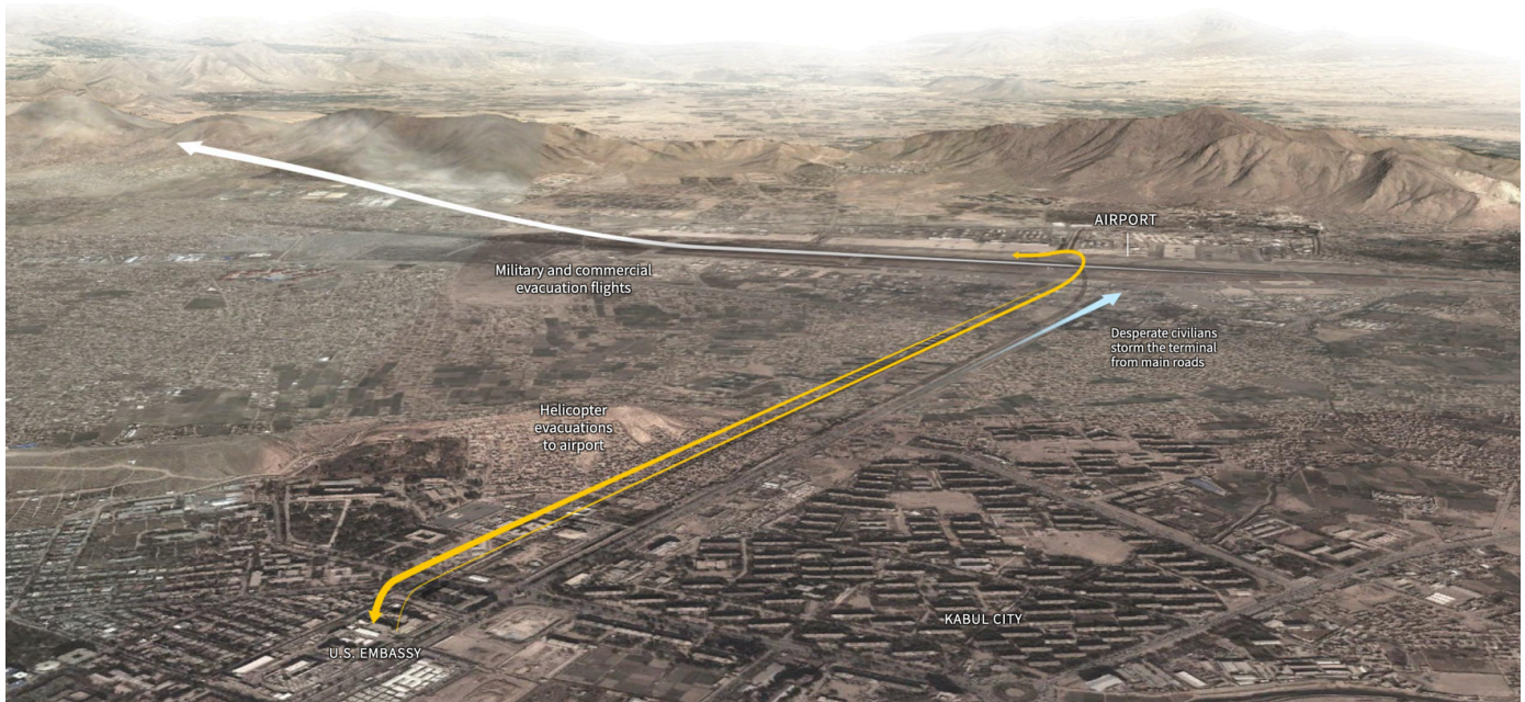
Satellite Overview of OAKB showing city, terrain, and Airport location